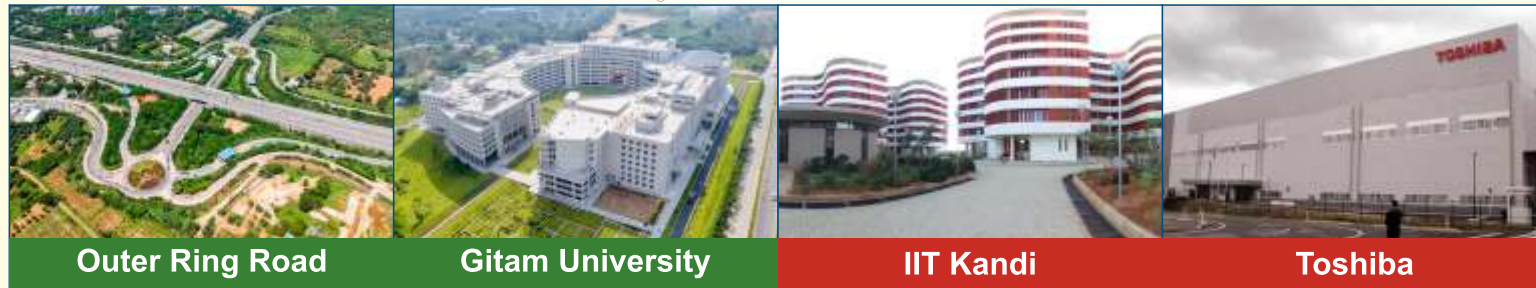
Outer Ring Road